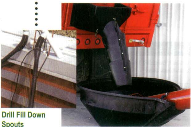
Drill Fill Down Spouts